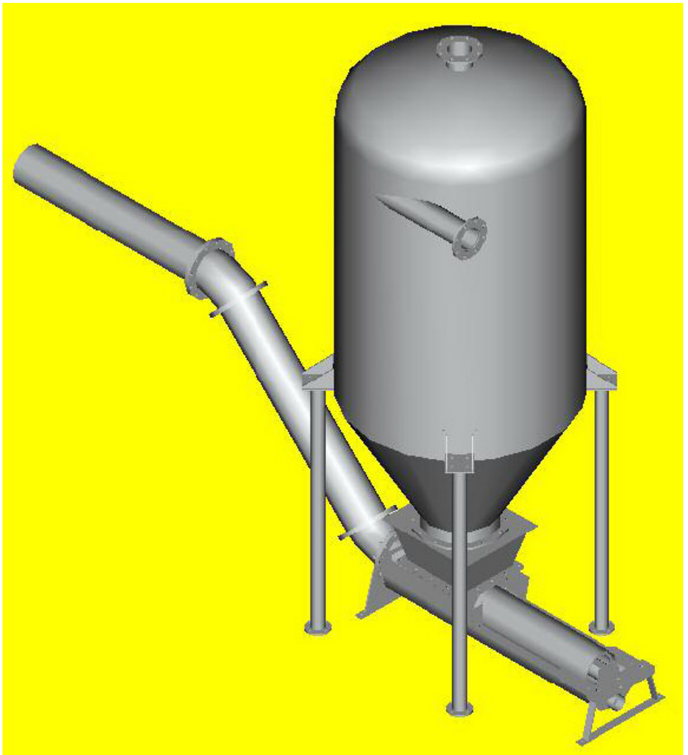
DEWATERING PRESS FOR RUMEN